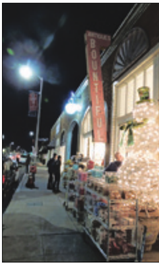
Abbot Kinney Boulevard in LA’s Venice neighborhood

Stores often seen in malls, such as Lucky Brand , opened