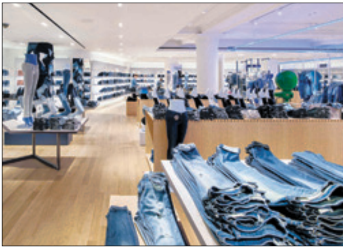
The Denim Studio at Selfridges in London