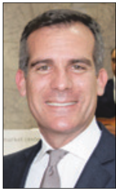
Los Angeles Mayor Eric Garcetti

"With wages rising in Asia and dramatic fluctuation in fuel costs, we have circumstances on our side," Garcetti said in October. "Combined with our natural advantages—with our status as a creative capital in film, music, TV; and the nation's leading center for contemporary art; the technology explosion that we're enjoying here—this is now one of the best cities to be a tech start-up—the intersection of fashion—and with these strengths, I think, we're poised to put Paris and Milan in the rear-view mirror, too."—A.A.N. ●