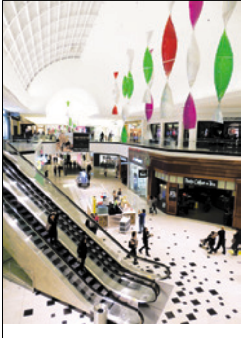
The Glendale Galleria

The renovation leaves a question unanswered, though. Who will move into a 140,000-square-foot space that formerly housed the Galleria's Nordstrom ? In a unique deal, the Galleria's Nordstrom moved across the street to the Americana at Brand retail center. The Americana's Nordstrom opened in September, and since then its former Galleria address has been vacant. Caruso Affiliated , the landlord of the Galleria Nordstrom space, had no comment on prospective tenants for the vacant space.—A.A.