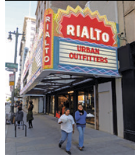
Urban Outfitters' downtown LA location

On Broadway, a sign on the marquee of the former Rialto Theater announces a Dec. 19 grand opening for a 10,000-square-foot Ur-