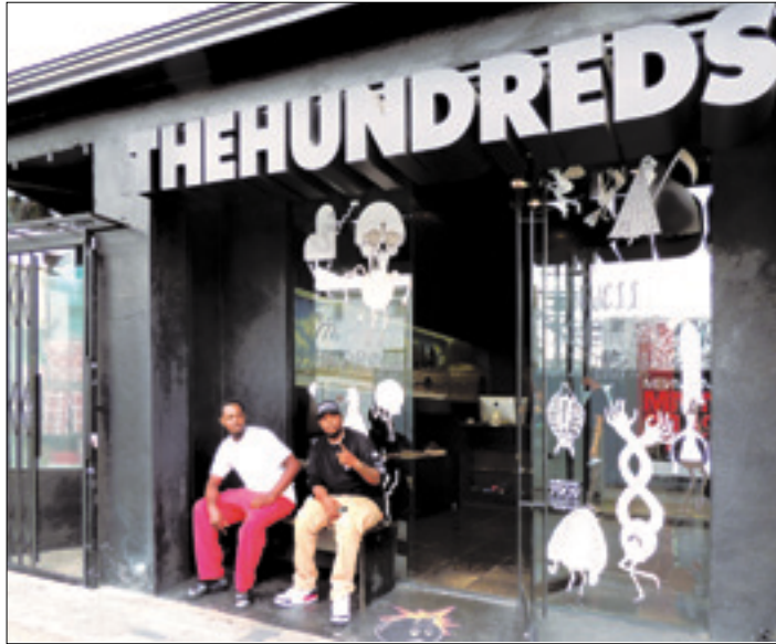
The Hundreds store on LA's Fairfax Boulevard

Every year, Metcheck organizes an annual meeting, called the "Crystal Ball," which gives CFA members prescient insights into the economy and current issues affecting the industry.