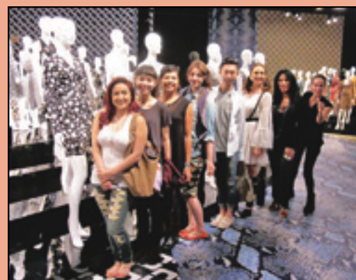
FCI Fashion Design students tour the Diane Von Furstenberg "Journey of a Dress" exhibit