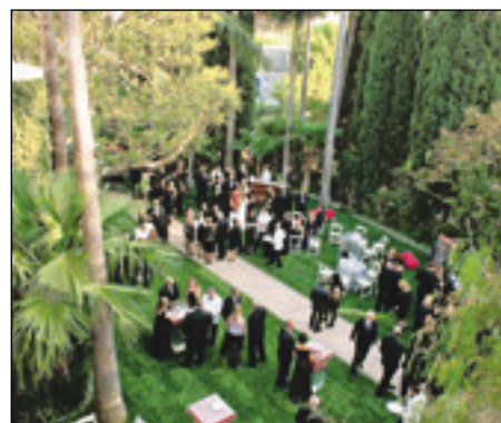
Before entering the ballroom at the Black and White Ball, guests enjoyed a tequila bar in an outside garden at The Beverly Hills Hotel.