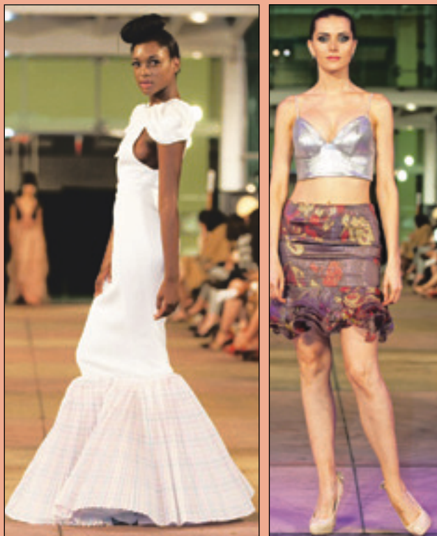
2014 Spring "Gold Thimble" Fashion Show at LATTC

It is a requirement that our career-technical faculty request input from industry partners. Part of that relationship is the understanding of trends in the industry and identifying job openings and career opportunities. Our instructors provide the best source of placement choices, and our campus Career Center provides support to students in areas such as resume writing, professional appearance, and interview preparation.