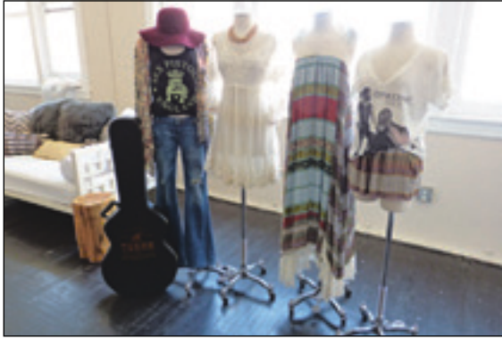
The Mary Joya Showroom, which recently relocated to the Lady Liberty Building, was showing the recently relaunched Trunk Ltd. line, as well as Artisan Deluxe, the new collection from the founder of Antik Denim.