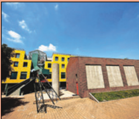
Loyola Law School's downtown Los Angeles campus is celebrating its 50th anniversary on Albany Street. The campus was designed by world-renowned architect Frank O. Gehry, who was awarded the prestigious 25-Year Award for the design by the American Institute of Architects.