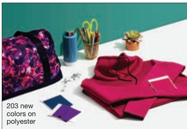
203 new colors on polyester

Key to the development process was collaboration: the trend spotters and prognosticators both within and outside the Pantone company, forecasters on synthetic material