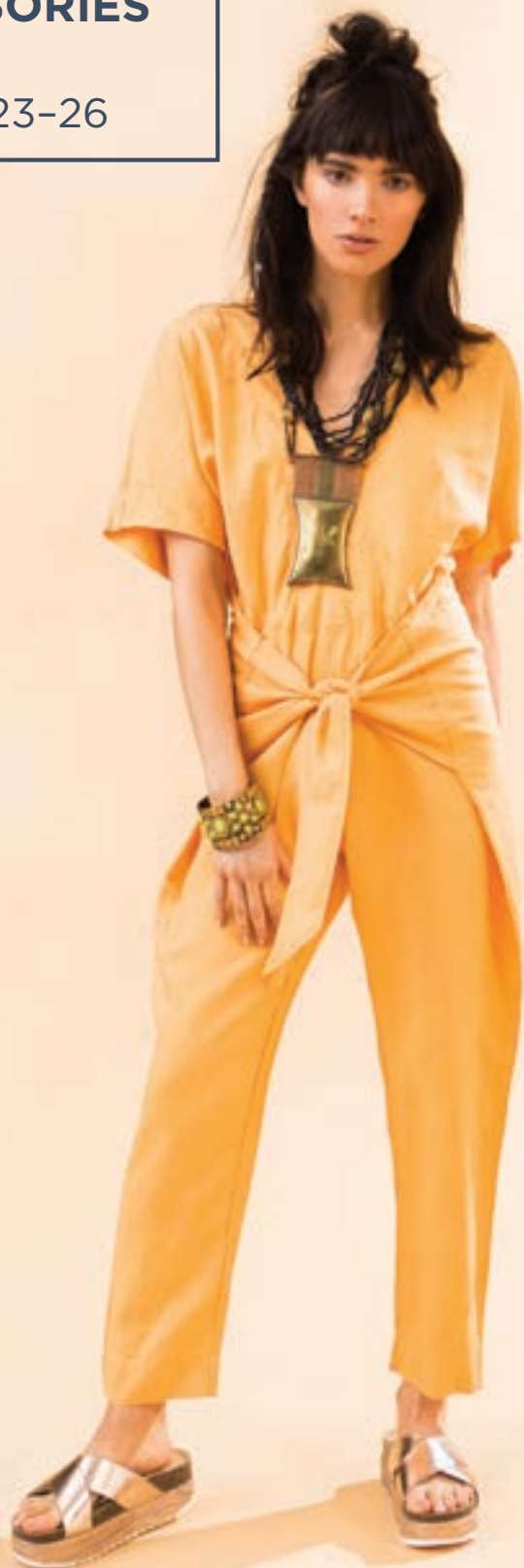
JUMPSUIT: D2 DRYSDALE - WTC 15452, 15634, 15654 | JEWELRY: SALLY DAVISON - WTC 13325 | SHOES: CORKY'S FOOTWEAR - WTC 13066