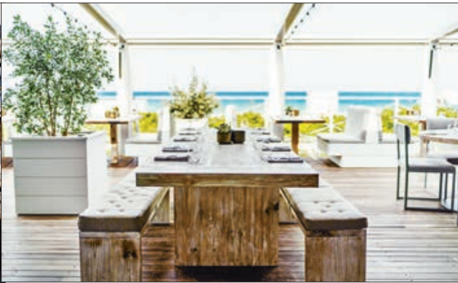
Malibu Farm Miami Beach

second location. I love to personally help all the clients who shop from me. So until I find a way to clone myself or split myself in two, there will only be one The Showroom.”