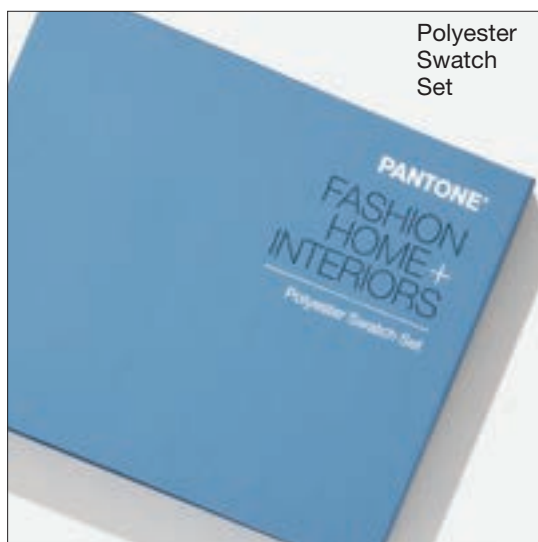
Polyester Swatch Set