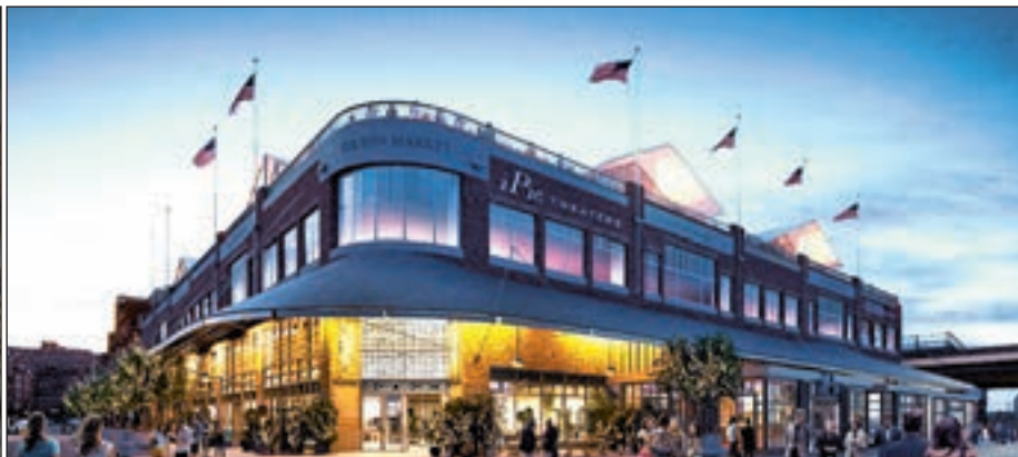
10 Corso Como

While editing Italian Vogue and Elle , Carla Sozzani worked with some of fashion's most celebrated photographers: Robert Mapplethorpe, Annie Leibovitz and Herb Ritts. In 1991, she got into the retail game.