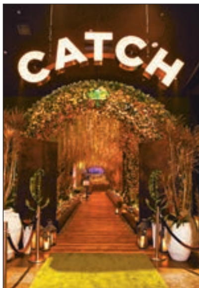
Catch Las Vegas