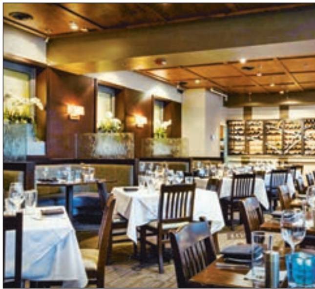
Ray's in the City