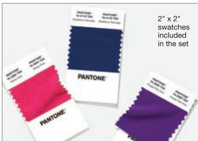
2" x 2" swatches included in the set