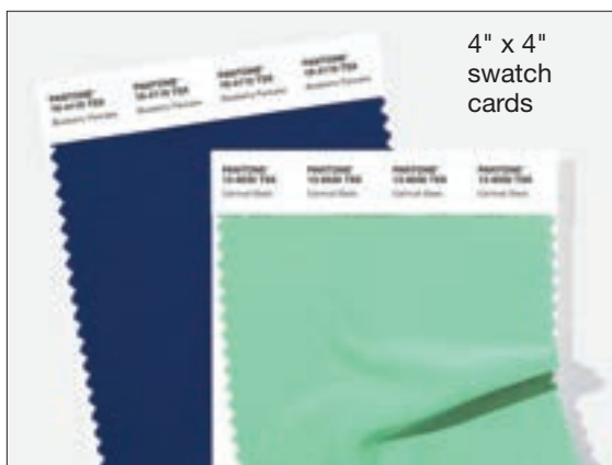
4" x 4" swatch cards