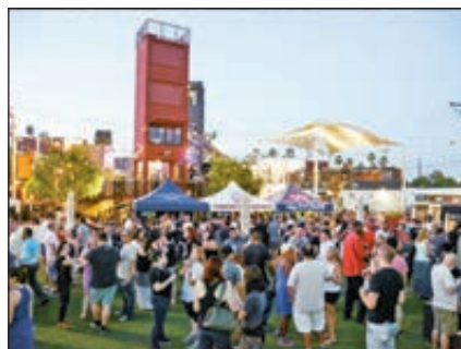
Downtown Container Park

Technology companies are part of the area's