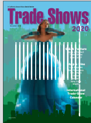
On The Cover: A look from Monique Lhuillier's Spring 2020 collection

Merchant Financial Group , located near the garment center in downtown L.A., offers non-recourse factoring, asset-based loans, inventory financing, purchase-order financing, letters of credit, and revolving lines of credit against other tangible assets, such as commercial real estate, trademarks, and royalty income. Our local management team offers quick responses, hands-on personalized service, and the flexibility to meet all our clients' needs. Established in 1985, Merchant Financial Group has become a leader in the industry, satisfying the needs of growing businesses. Merchant services the entire United States, with offices domestically in Los Angeles, Fort Lauderdale, and New York. www.merchantfinancial.com