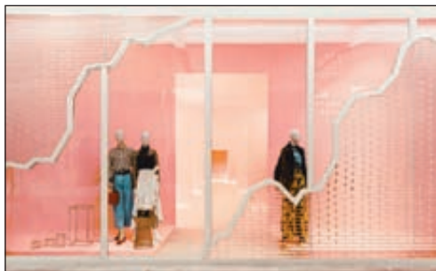
Forty Five Ten