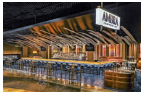
Ambra Italian Kitchen + Bar

mix of businesses. There are also restaurants, shops and a 19,000-square-foot site called Downtown Container Park. This open-air center features shops, dining, art galleries, a kids' playground and concert venues, all of which are housed in a compound of 30 repurposed shipping containers and 41 multifunctional modular cubes.