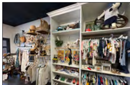
In just four months, founders of Project ReWear Kimberly Lau and Linda Young have saved 1,000 pounds of clothing, or over 1.5 million gallons of water and 24,000 pounds of CO 2 .

“At this stage we’re most passionate about showing people that small, everyday choices—like buying secondhand—can create huge ripple effects,” said the duo.